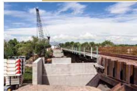
Second Main Track Construction – Arvada, Colorado

Consistently ranked as one of the nation's top contractors, SEMA is a collaborative partner that brings integrated product delivery methods and award-winning construction solutions to every project.