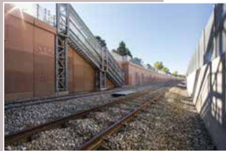
Custom Egress Access Point, I-225 Nine Span Light Rail Bridge Project – Denver, Colorado