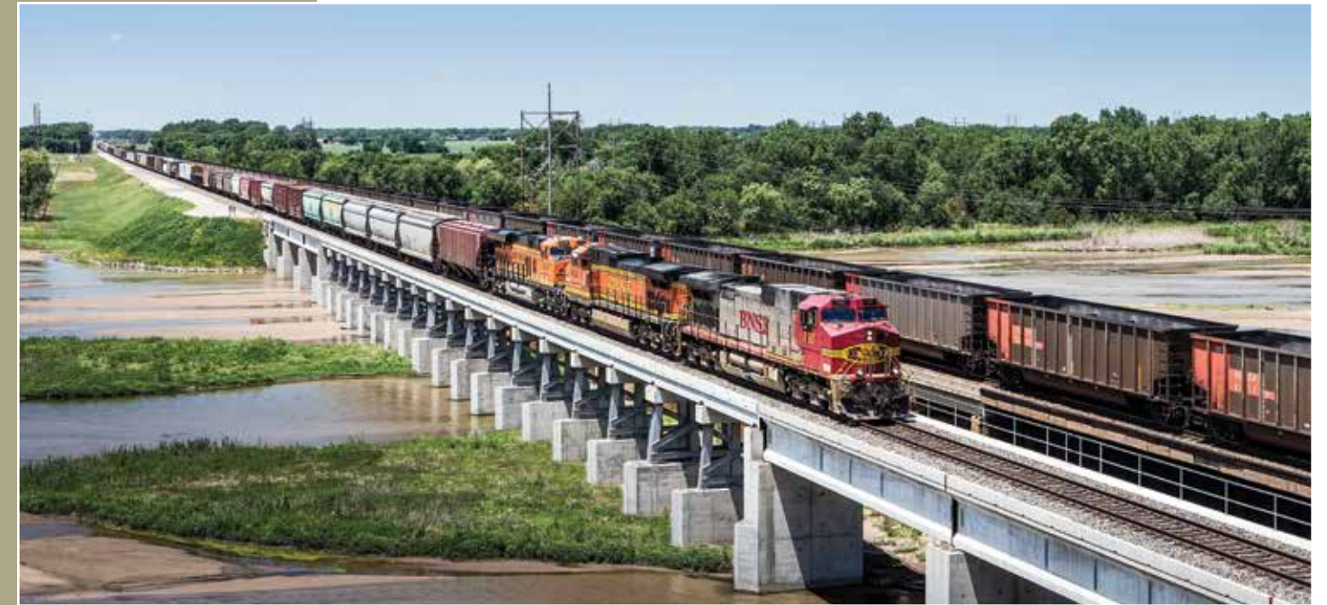
This 8.2-mile, double-main project involved the construction of a new main line and a 28 span, 905-foot bridge over the Platte River. Phillips to McDonald – Grand Island, Nebraska