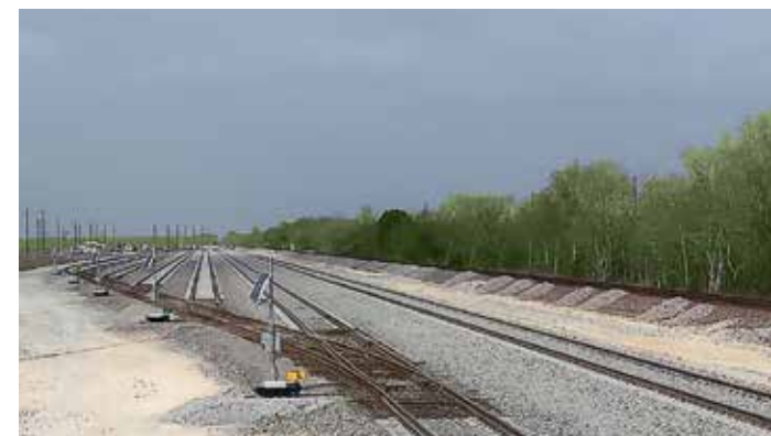
Jefferson Davis Support Yard Project – Lacassine, Louisiana