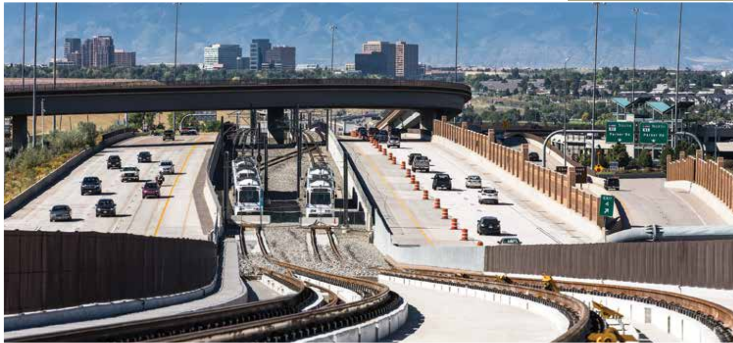
SEMA constructed this nine span LRT bridge, extending light rail services as part a 10.5-mile extension through the City of Aurora and a small section of Denver. I-225 Nine Span Light Rail Bridge Project – Denver, Colorado