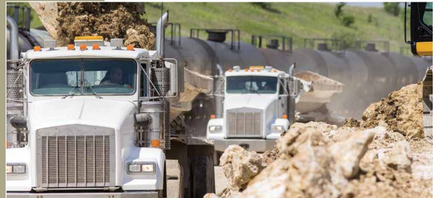
This 12-mile project realigned sections of the Main #2 Track and the Auto Facility Connector Track. The project scope involved the construction of nine bridges and 600,000 cubic yards of rock excavation. Alliance Main #2 Track Relocation – Fort Worth & Haslet, Texas

Each year, SEMA constructs railway infrastructure projects across the United States that cross a wide variety of environmental ecosystems, waterways, animal habitats, and historically valuable sites. Our sensitivity to the environment extends beyond mere compliance with environmental protection laws. We lessen the indirect environmental impacts of the construction process through comprehensive recycling and material management procedures.