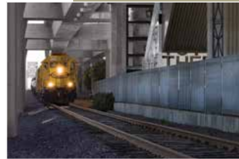
Douglas Street Gap Closure Railroad Grade Separation – Los Angeles, California