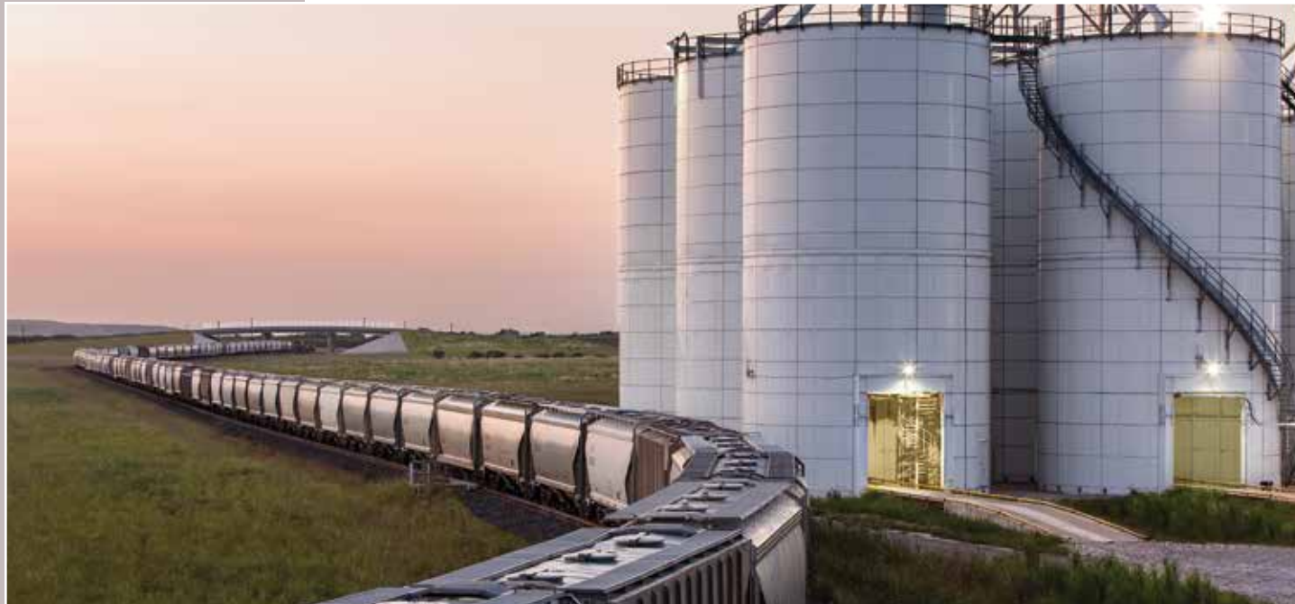
SEMA transformed this six-acre area of farmland and provided railway services to the transload facility located here within 120 days. San Antonio Freeport – San Antonio, Texas