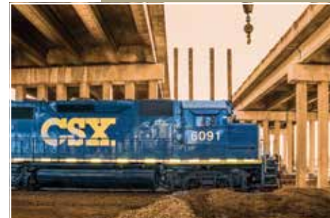
Beachline Widening Project – Orlando, Florida