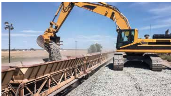
SEMA responded immediately, and deployed over 100 pieces of equipment for railroad repair during catastrophic flooding. Emergency Flood Restoration Work – Eastern Colorado

From light and heavy rail projects, to intermodal and support yard systems, to emergency restoration, clients choose SEMA because our turnkey solutions deliver superior results.