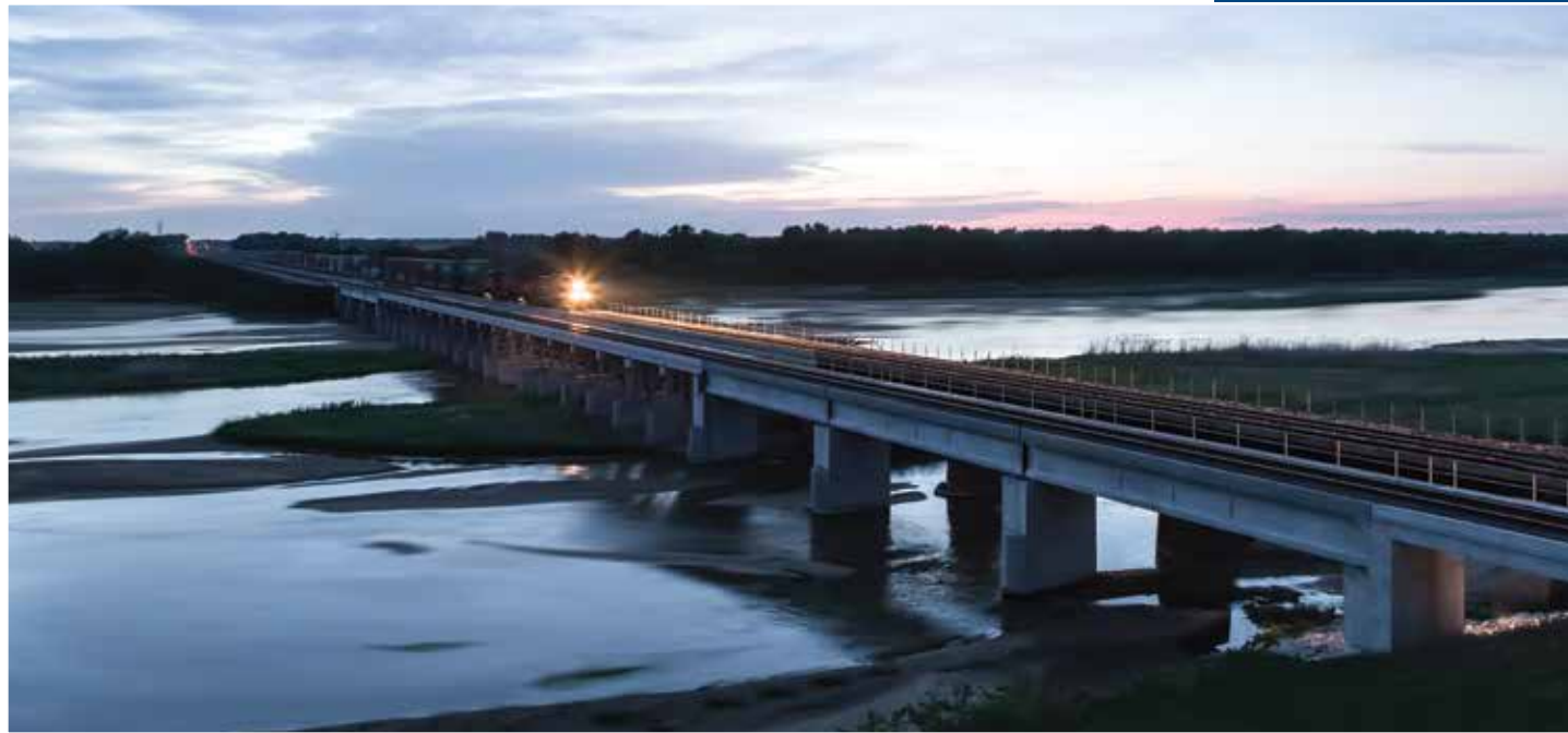
Phillips to McDonald – Grand Island, Nebraska