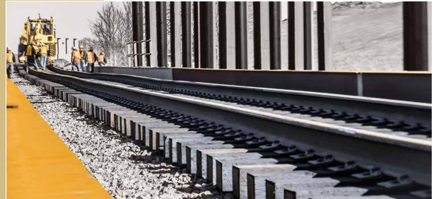
This project relocated two miles of railway including 100,000 cubic yards of embankment, over 12,000 feet of track and ties with ballast, and the construction of two new bridges. K-18 Track Relocation Project – Manhattan, Kansas