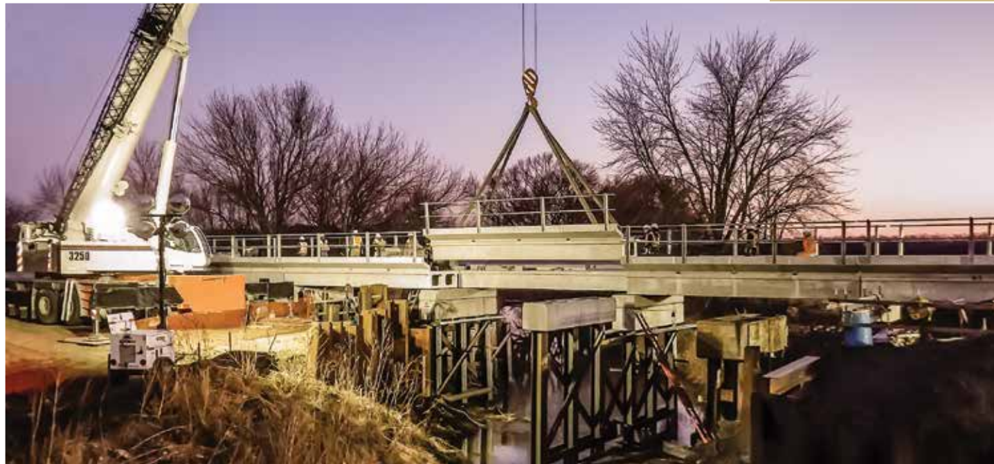
This double track project involved the removal and replacement of a 200-foot bridge within an 18-hour shutdown window. Second Main Track Construction – Arlington, Nebraska