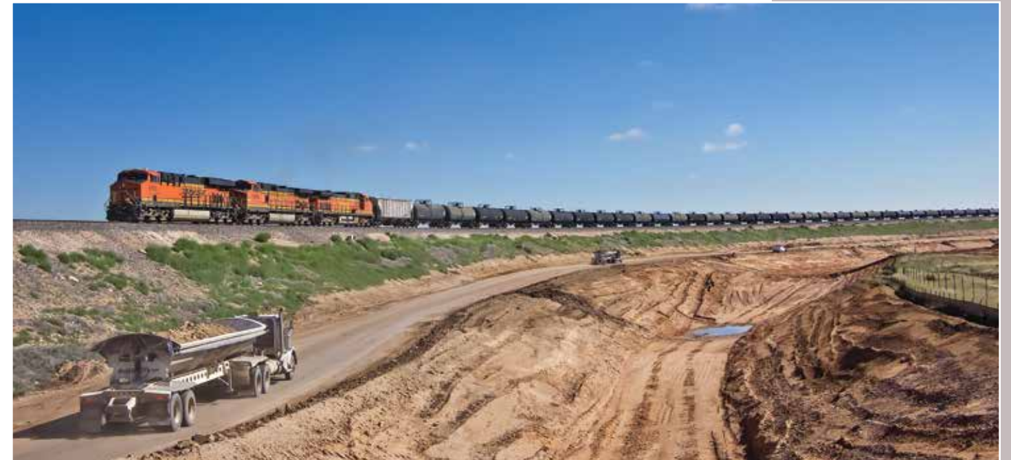
This 10-mile, second main line project involved more than two million cubic yards of earthwork, arch and multi-plate culverts, and the construction of two new bridges. Over 80 pieces of equipment were utilized at one time in order to complete this project in less than one year. New Mexico Capacity Improvement Project – Vaughn, New Mexico